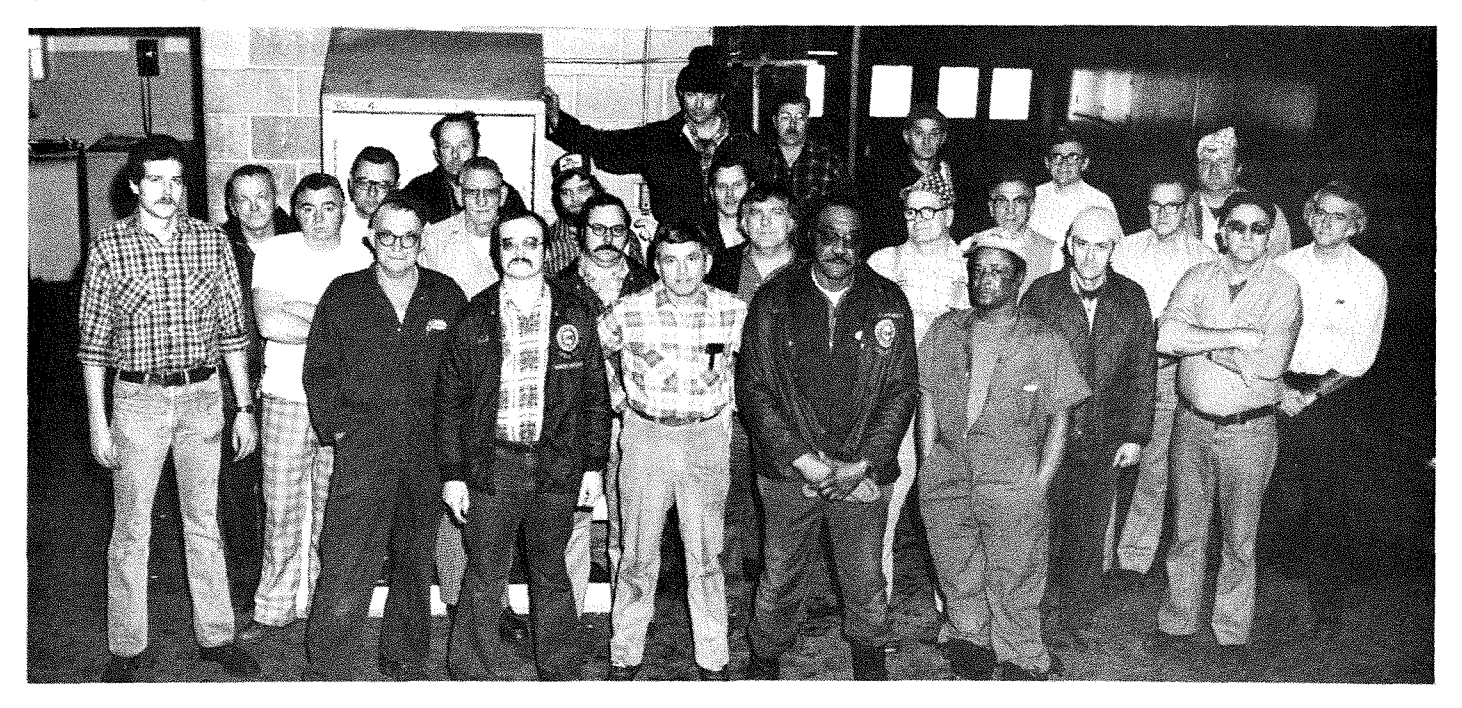
CONGRATULATIONS to TEAM 13 — Maintenance, Plants 1 and 2 — taking first place honors in the December Safety First contest. Representing all three shifts of this team are members from the first shift.

VALENTINES SEND LOVE ... Sending declarations of love on St. Valentine's day originated in medieval France and England.